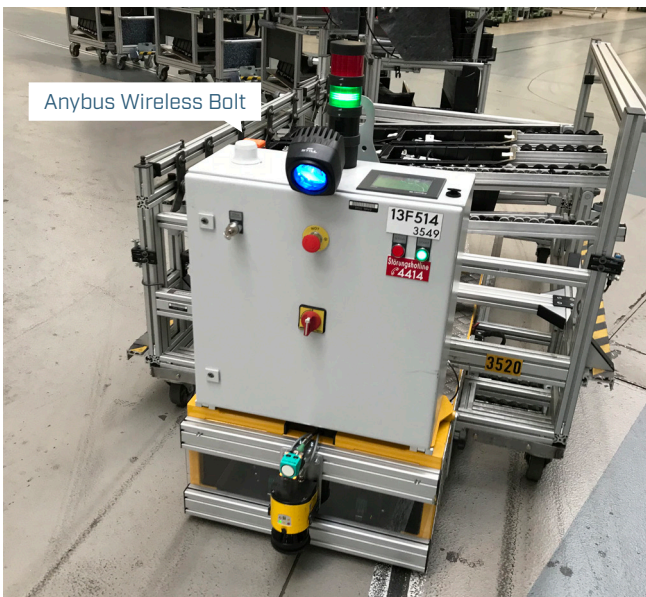
Anybus Wireless Bolt

“These Anybus Wireless devices using Bluetooth are well-suited for applications that need to exchange data wirelessly, where the speed and data volume of the connection is secondary and stability is more important.”