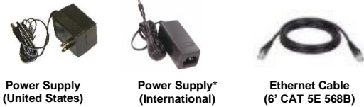
Figure A: Package Contents R-3300 or R-1300: