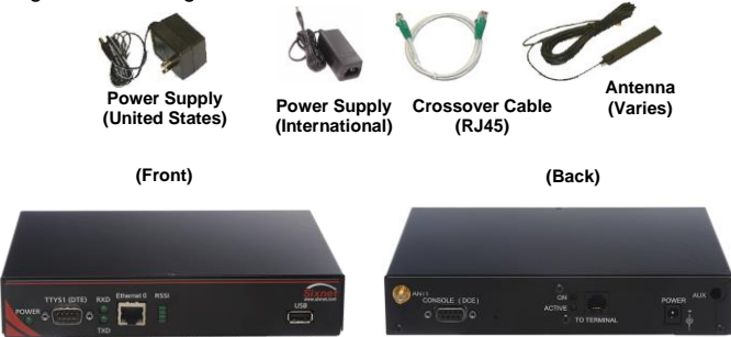
Figure A: Package contents:

Note: Non-US power supplies require customer-supplied power cord to connect power supply to AC power outlet.