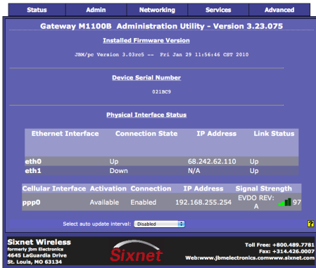
Figure B: GUI:

You are now connected to the Management GUI.