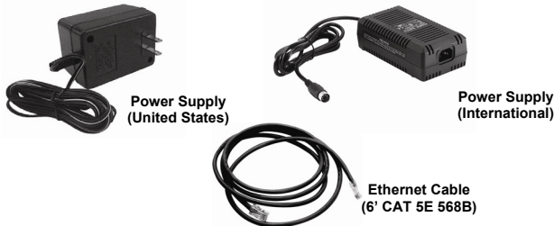
Figure A: Package Contents M-1300: